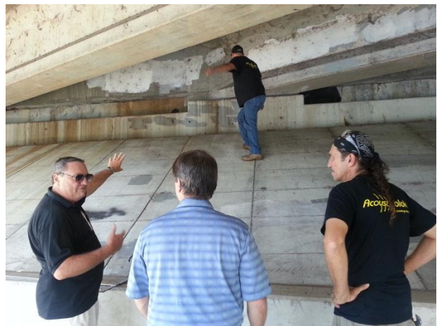
Project testing team members from Acoustiblok and R.J. Watson discuss the source of noise and treatment options.