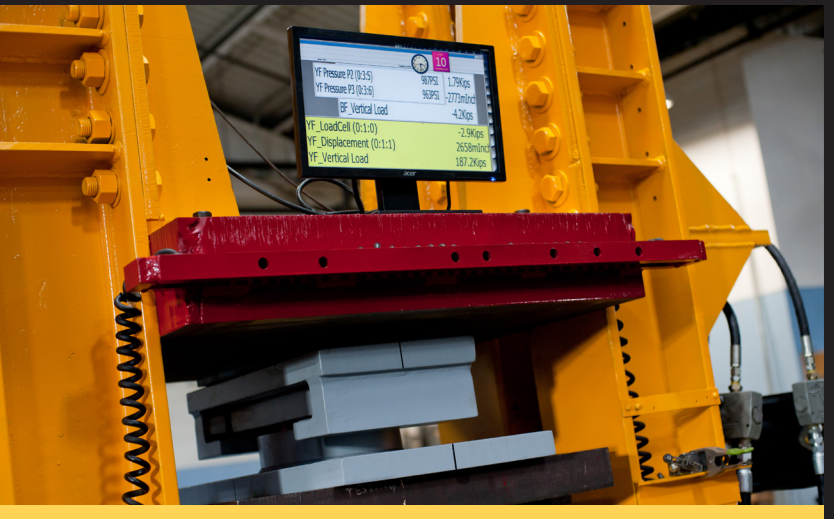
Friction Testing with Simultaneous Vertical Load