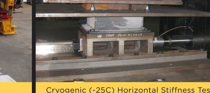
Cryogenic (-25C) Horizontal Stiffness Test on an Elastomeric Bridge Bearing. 10 inch displacement, using RJ Watson's 48 inch Actuator