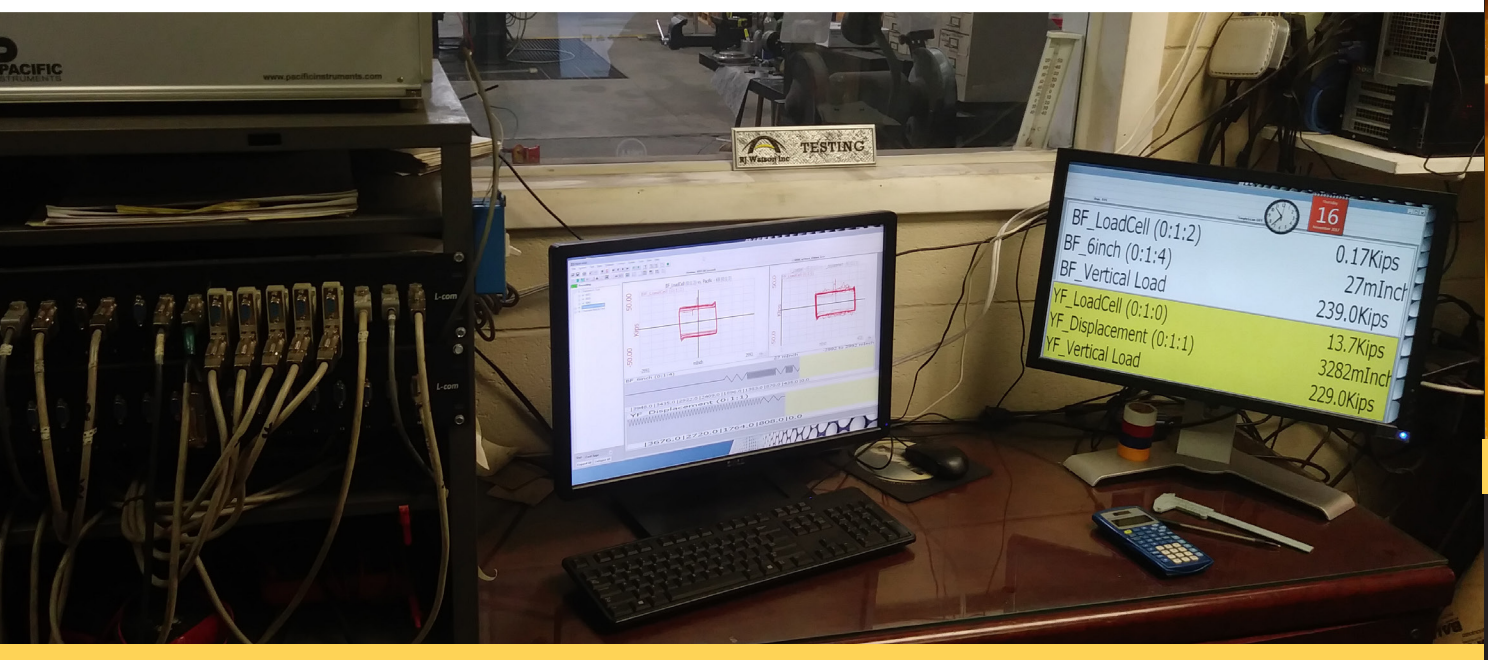
Data Acquisition: 16 Available Channels for many types of measurement devices, High Sample Rates, Live Video Streaming Ability.

Experienced Staff: Our staff of engineers are well experienced in design, setup, instrumentation, and data analysis, ready to support you and your testing needs.